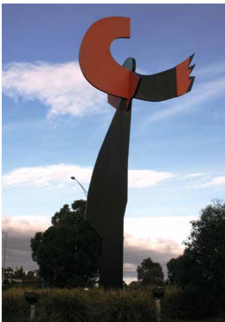
8. Immerse, 2008, Warren Langley, ceramic tiles and LED lighting (right)

Created by internationally renowned artist and long-term resident Inge King, Sentinel was conceived as an icon of the City of Manningham and the sculpture casts a watchful eye over the area. The multicoloured crown is the focal point of the work. Its curved shapes symbolise the two creeks of the municipality, the Mullum Mullum and the Koonung. They enclose the blue oval form representing the City of Manningham.