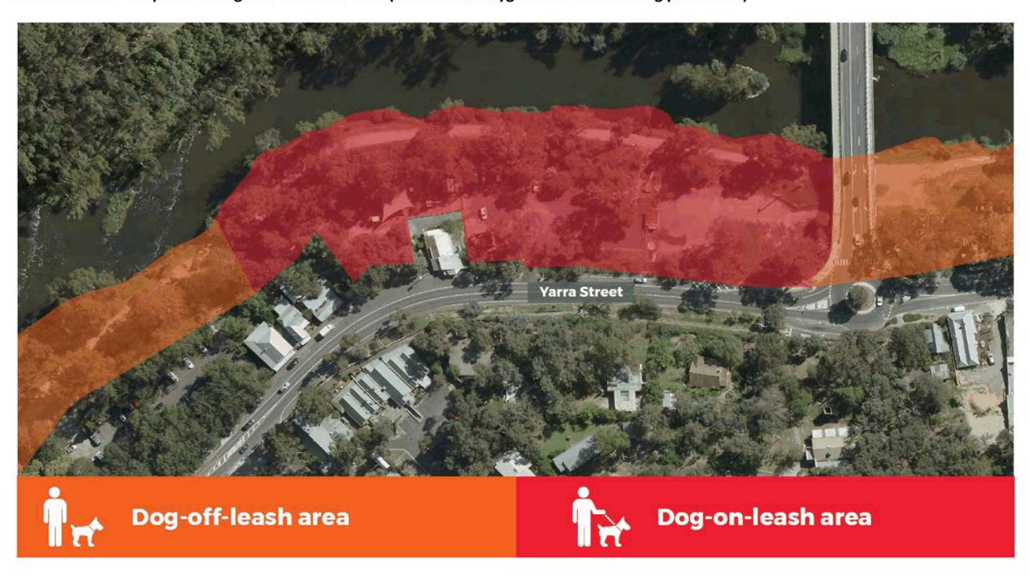
Attachment 1 – Proposed changes to Off Leash area (Federation Playground to remain dog prohibited)