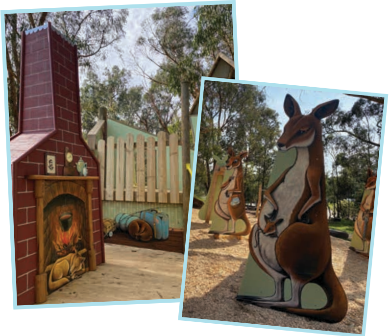
ABOVE: Gooligulch playspace restoration in Wonga Park.