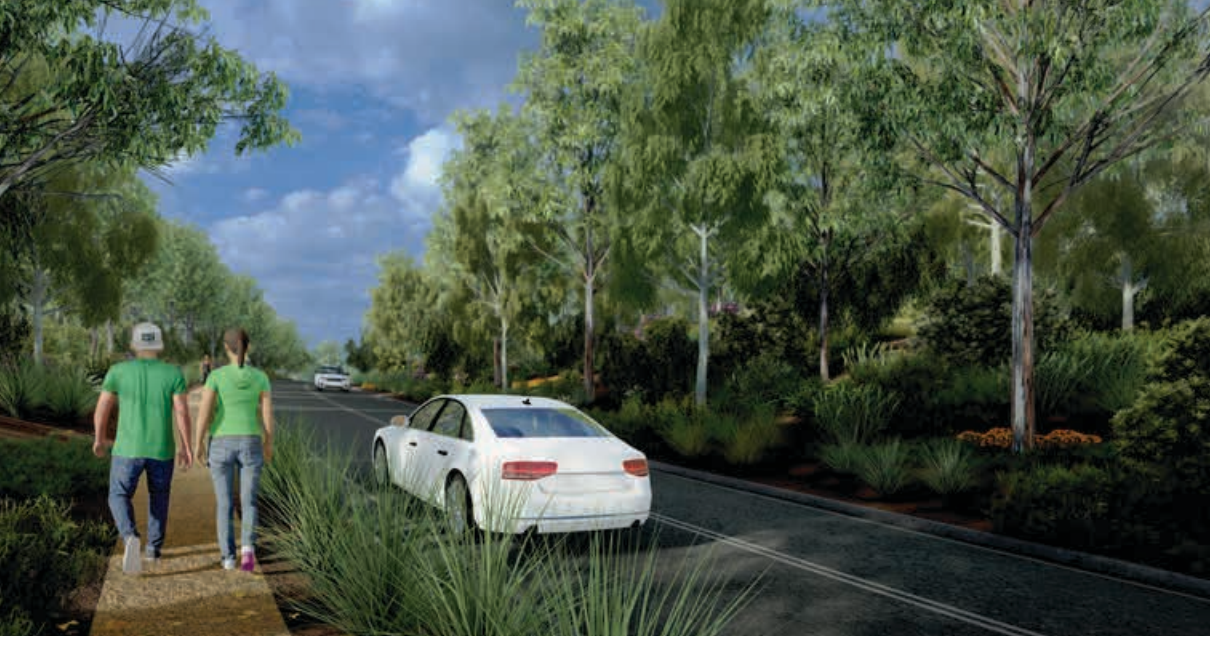
ABOVE: An artist's impression of the Jumping Creek Road upgrade.