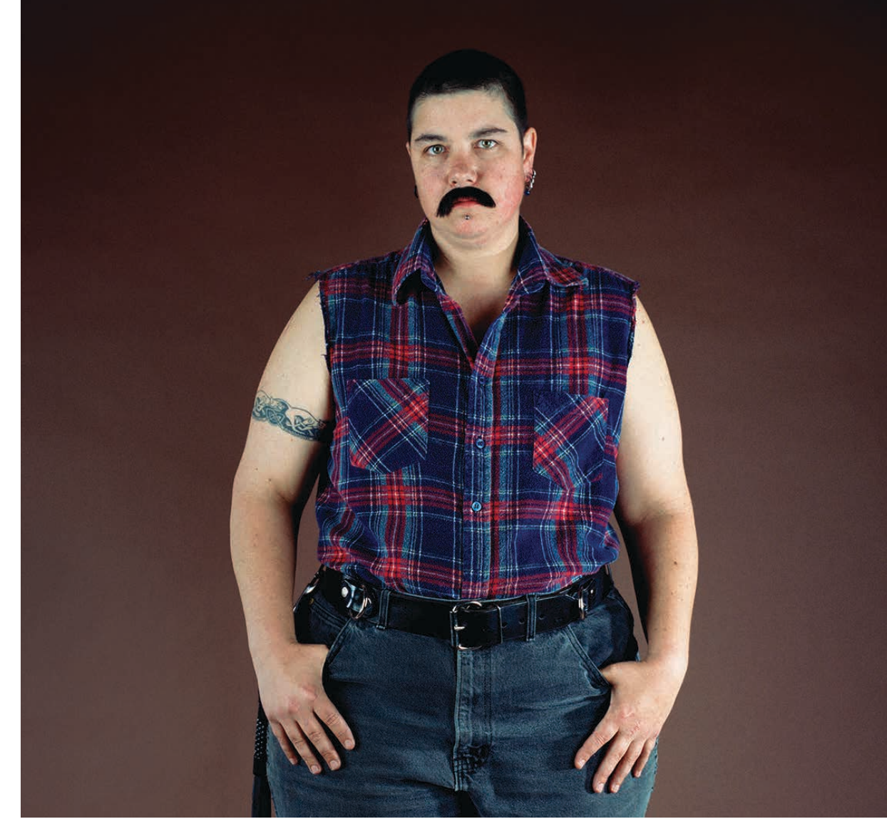
ABOVE: Catherine Opie, Bo , 1994, C-type print, 152.4 x 76.2 cm, © Catherine Opie Courtesy Regen Projects, Los Angeles and Lehmann Maupin, New York, Hong Kong, London and Seoul.