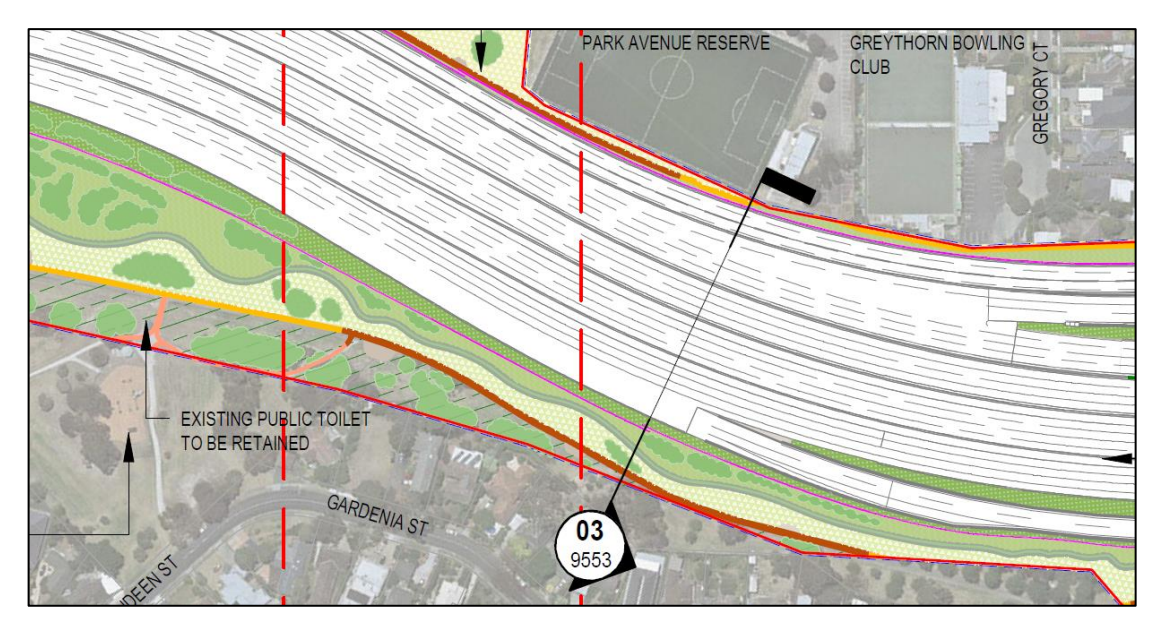
Figure 4 – Excerpt of UDLP Attachment 2, Part 1, page 24 (drawing 9530) showing the location of Cross Section 03 - which is taken through the existing path rather than the wider SUP and does not show the interface with the Soccer pitch.