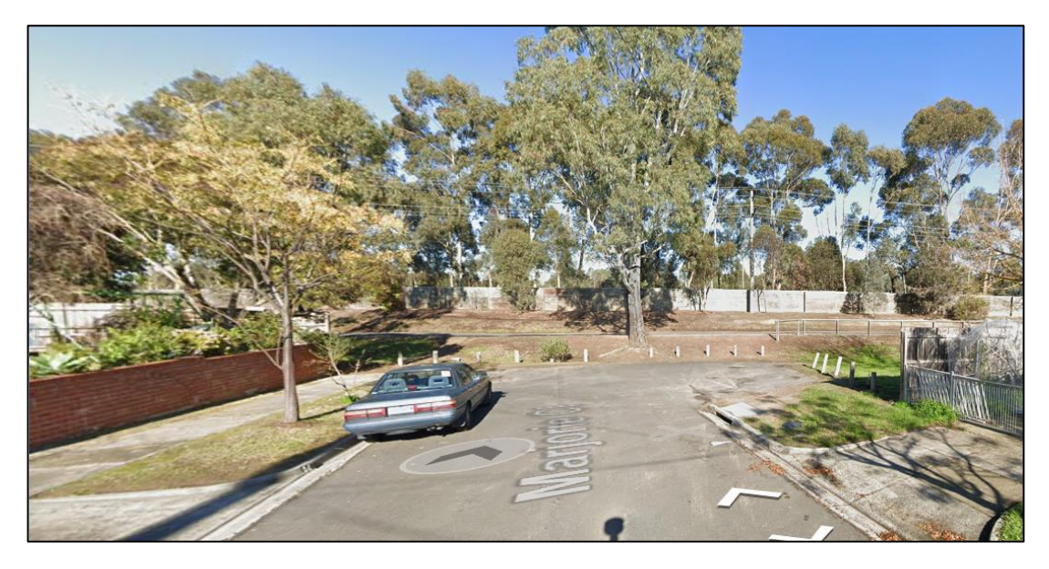
Figure 1 – Streetview image showing the view from Marjorie Close looking south towards the existing freeway noise walls.