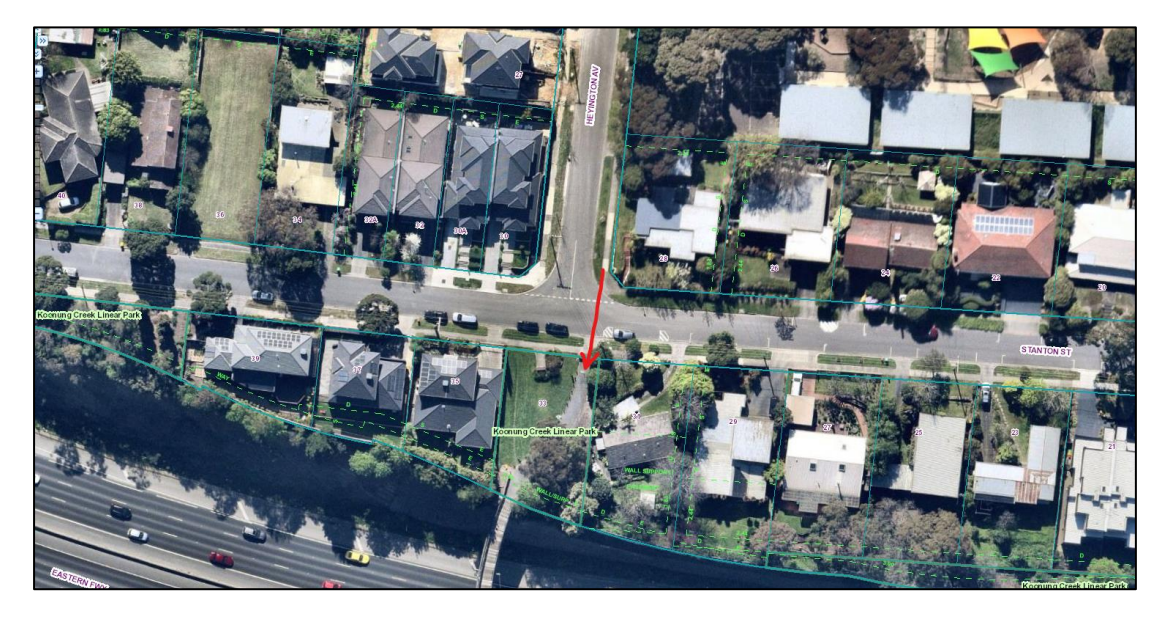
Figure 2 – Heyington Avenue / Stanton Street intersection with the crossing point of concern indicated in red.

33. Options to upgrade the Heyington Avenue / Stanton Street intersection should therefore be explored to improve safety outcomes at this location, in particular given the newly proposed pedestrian bridge has the same access point as the current one,