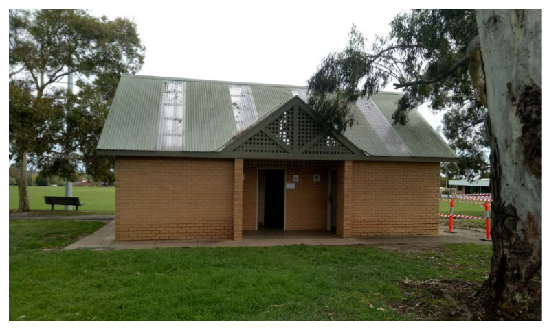
A. Older style standalone facility with gender segregated toilets.

Council also has an agreement with Beasley's Nursery that their facilities be available to the general public during opening hours.