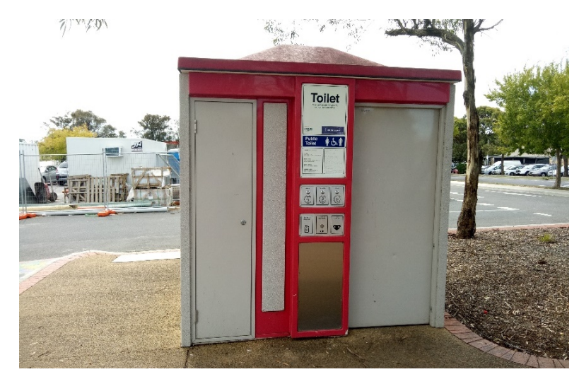
C. Standalone facility with unisex self-contained toilets – automated maintenance.

The National Public Toilet Map also lists a number of petrol stations that have been registered by their owners as public toilets.