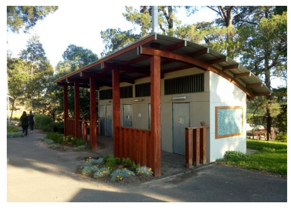
Manningham Public Toilet Plan 2021