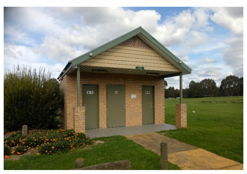
B. Standalone facility with unisex self-contained toilets – manually maintained.