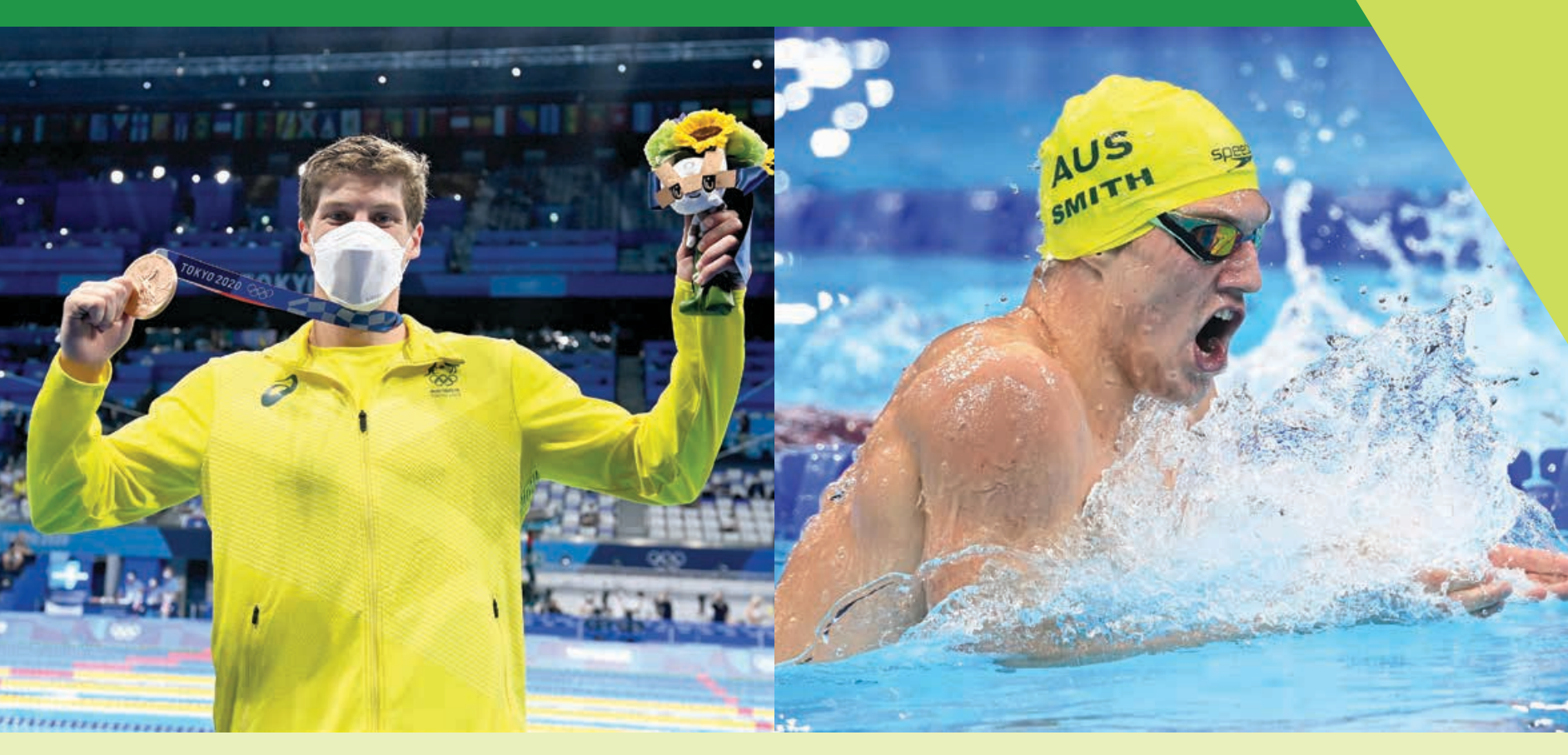
ABOVE: Brendon Smith winning bronze at the 2020 Tokyo Olympics.